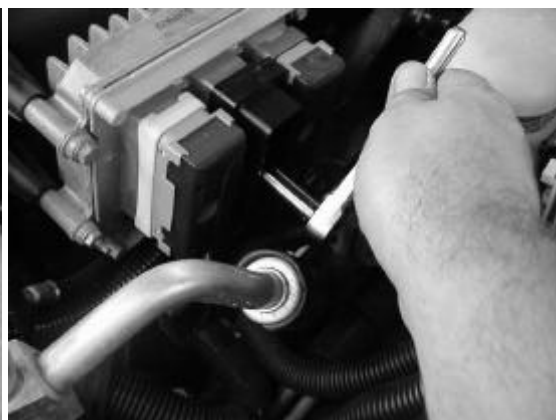
Fig # 4 tighten extender bolt