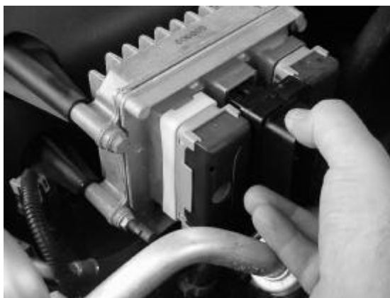
Fig # 3 installing JET PCM