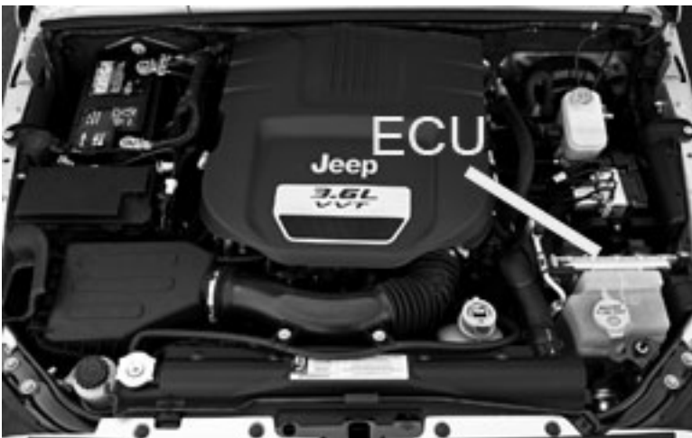
Jeep Grand Cherokee